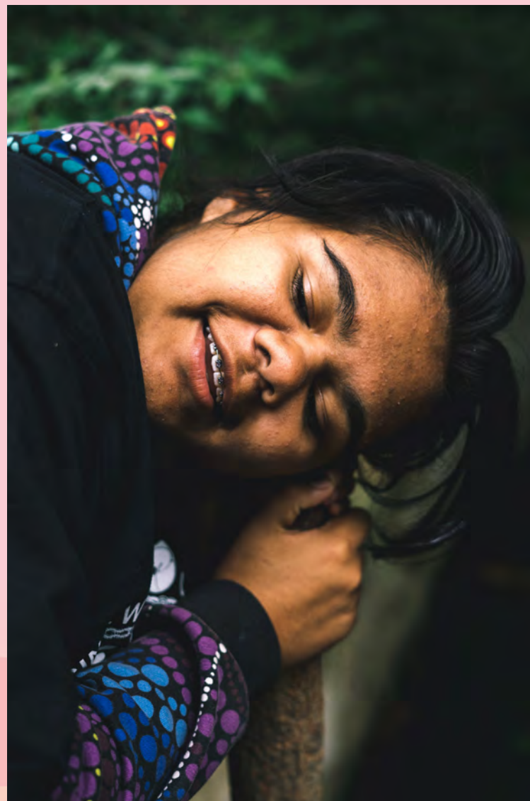
Poetry in First Languages poems installed in Cookaroo Flow.