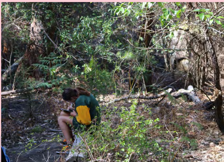
Poetry in First Languages Yuin.w