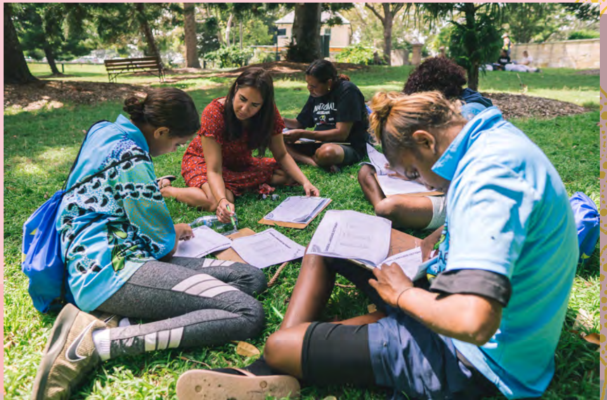
Poetry in First Languages, Gadigal.