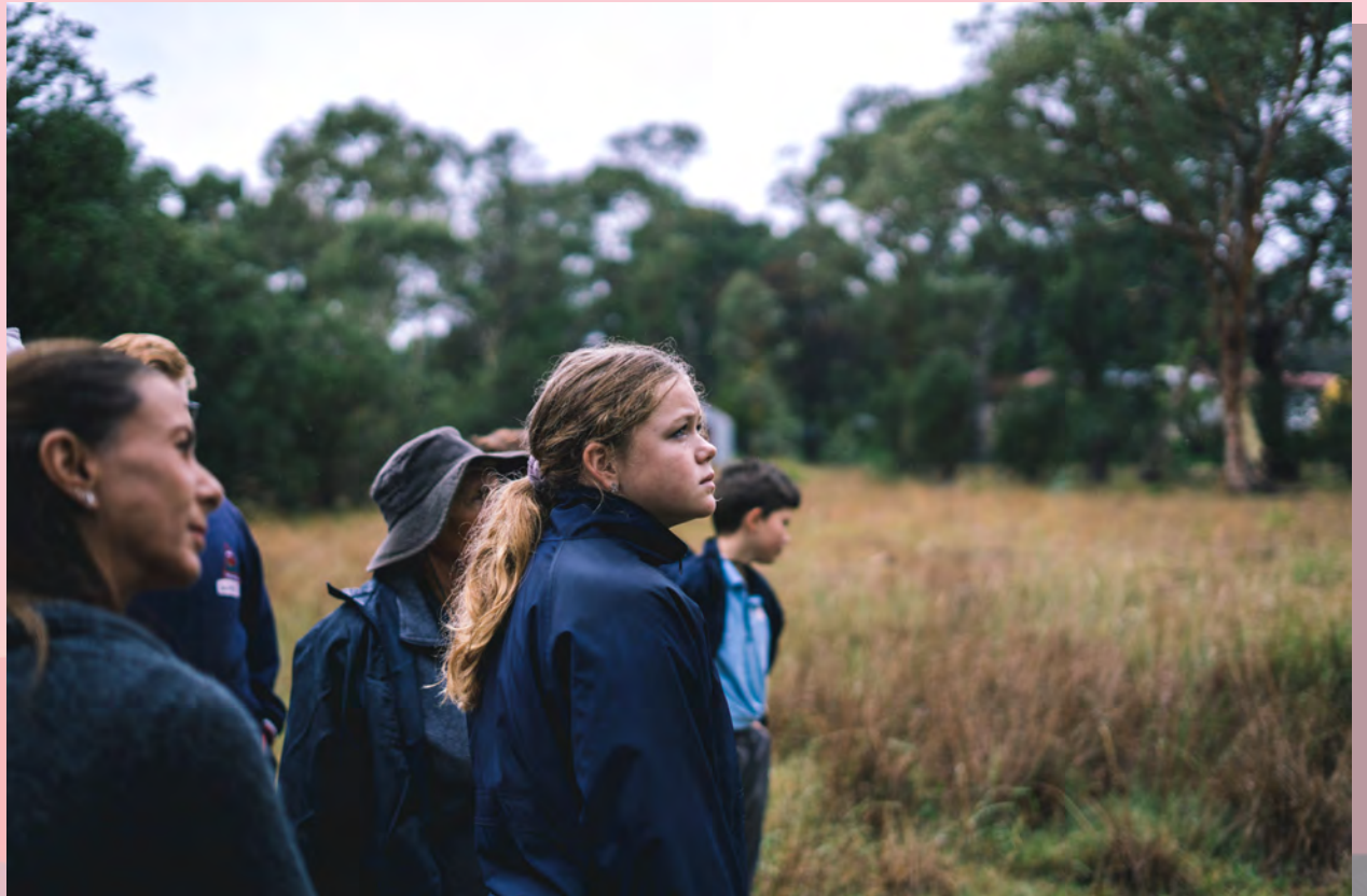
Poetry in First Languages Gundungurra.