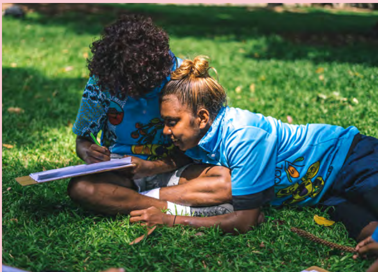
Poetry in First Languages, Gadigal.